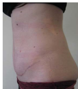
6 weeks POST