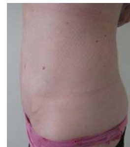
1 YEAR POST